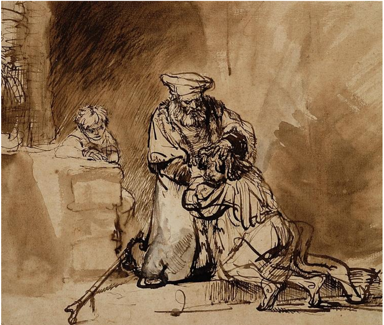
The Return of the Prodigal Son, Rembrandt 1642

'As a father cares for his children, so does the Lord care for those who fear him.' Psalm 103.13