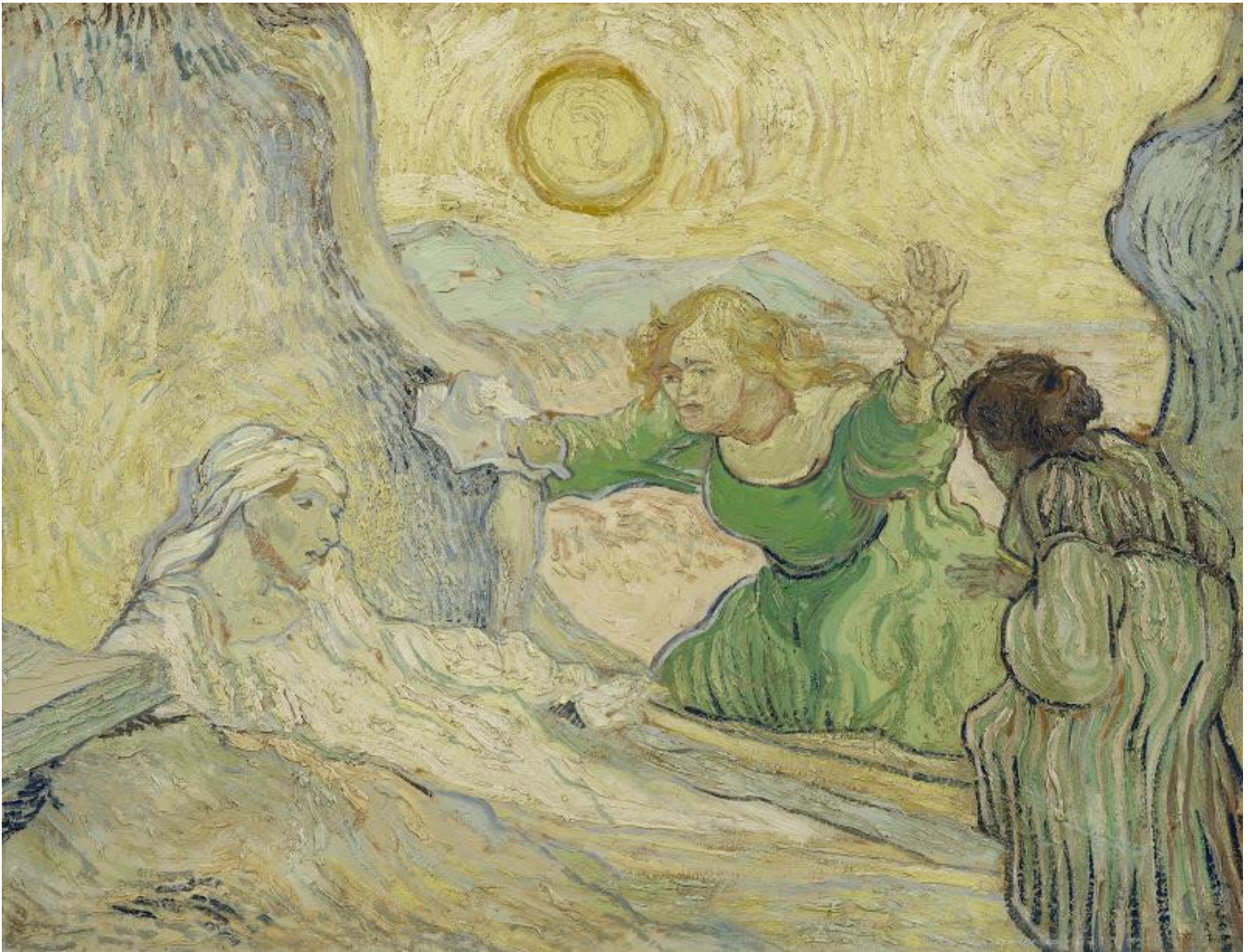
The Raising of Lazarus (after Rembrandt), Vincent van Gogh, 1890 Van Gogh Museum, Amsterdam (Vincent van Gogh Foundation)

For nearly 200 years Holy Trinity Nice has been a center of Christian worship for English-speakers on the Riviera. Located steps from the Promenade, we offer all a warm welcome – as an historic site, a quiet place for contemplation, and a vibrant church community. We come from across the globe; we come from many denominations; and we welcome you!